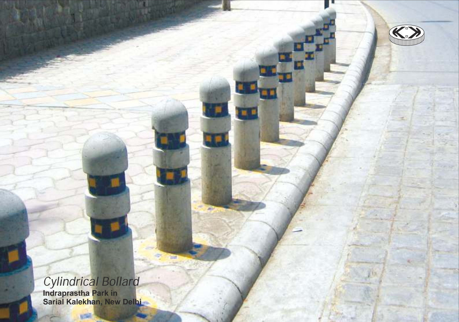
Cylindrical Bollard Indraprastha Park in Sarai Kalekhan, New Delhi