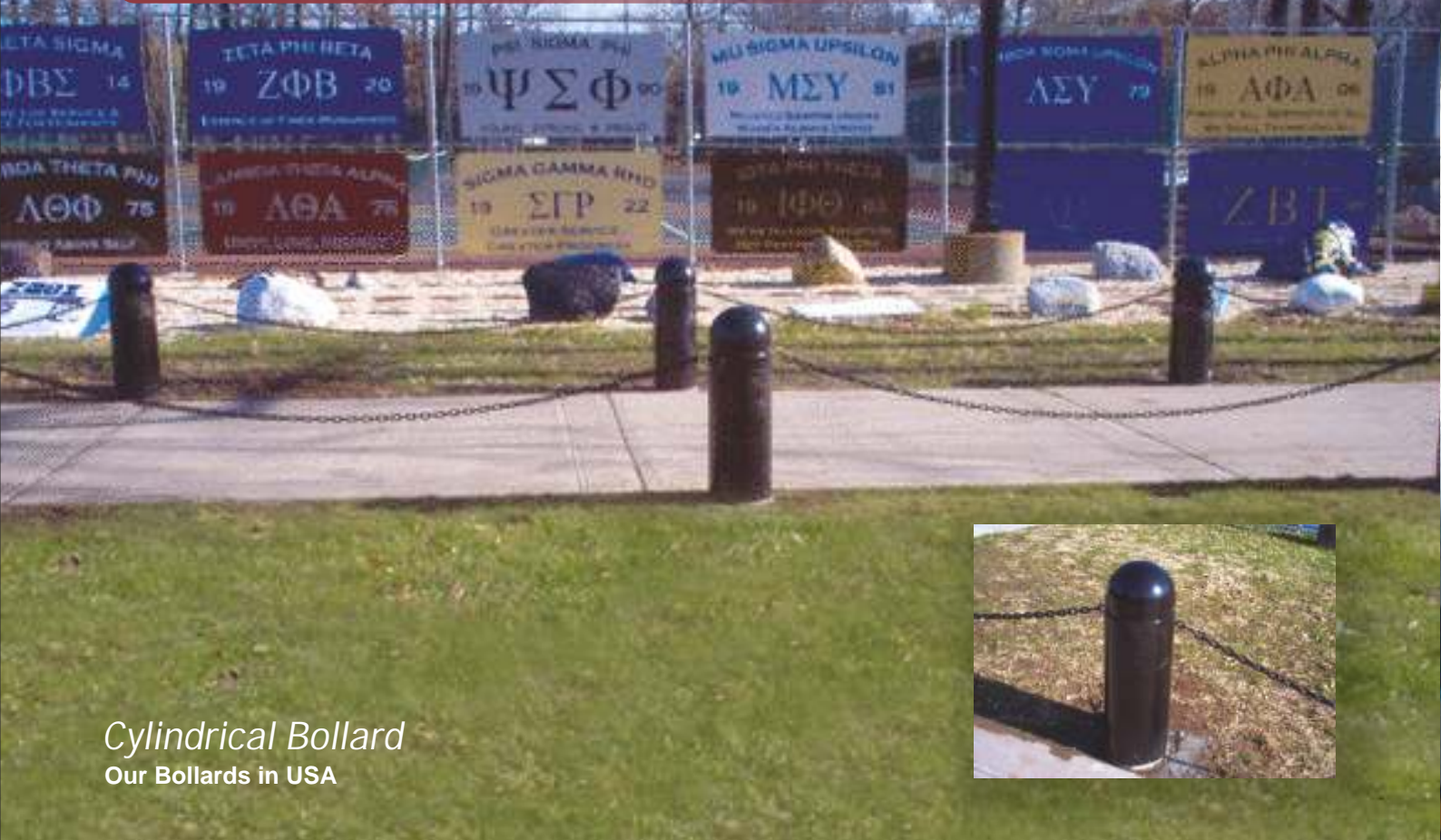
Cylindrical Bollard Our Bollards in USA