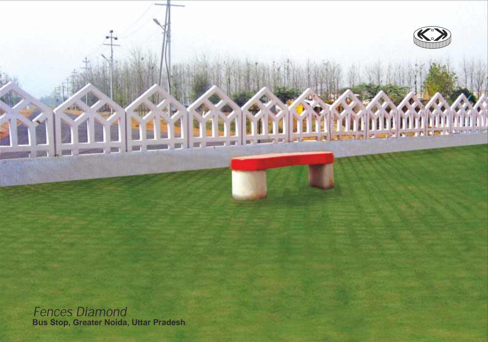
Fences Diamond Bus Stop, Greater Noida, Uttar Pradesh