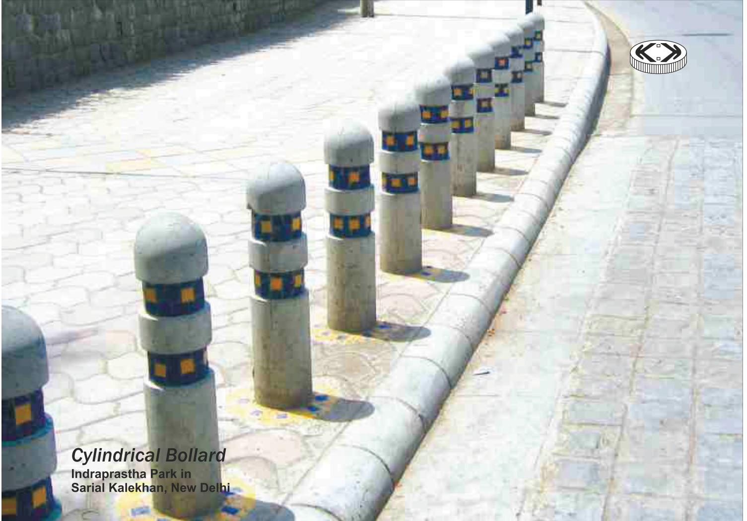
Cylindrical Bollard Indraprastha Park in Sarai Kalekhan, New Delhi