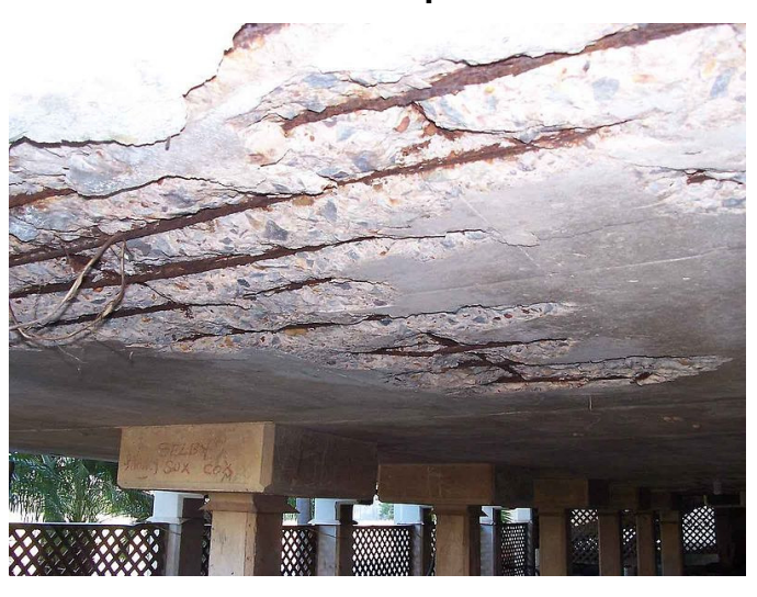
Figure 2: Showing what happens if cover is not adequate